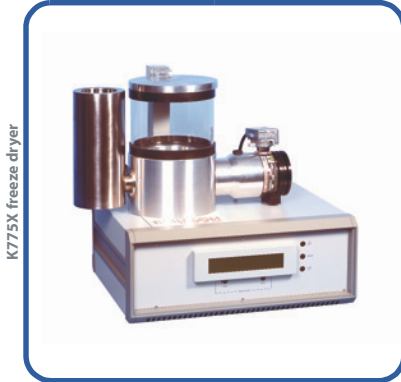
K775X freeze dryer